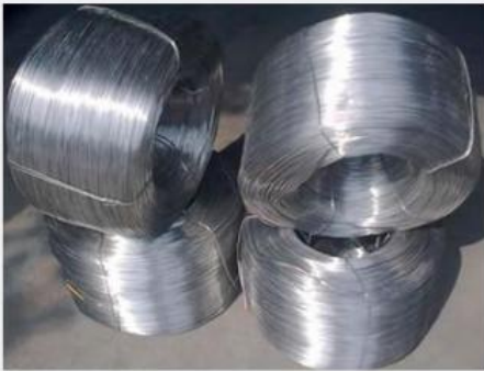
Stainless steel spring wires are widely used in electron, chemical and medical equipment, etc.