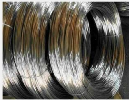
Stainless steel bright wire is applied in petroleum, electronics, machinery and construction, etc.